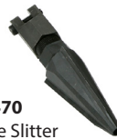
82000470 1" Water Line Slitter