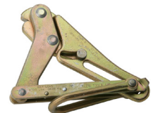
82000500 Cable Gripper