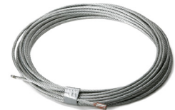
82000460 Aircraft Cable 3/8" x 75'